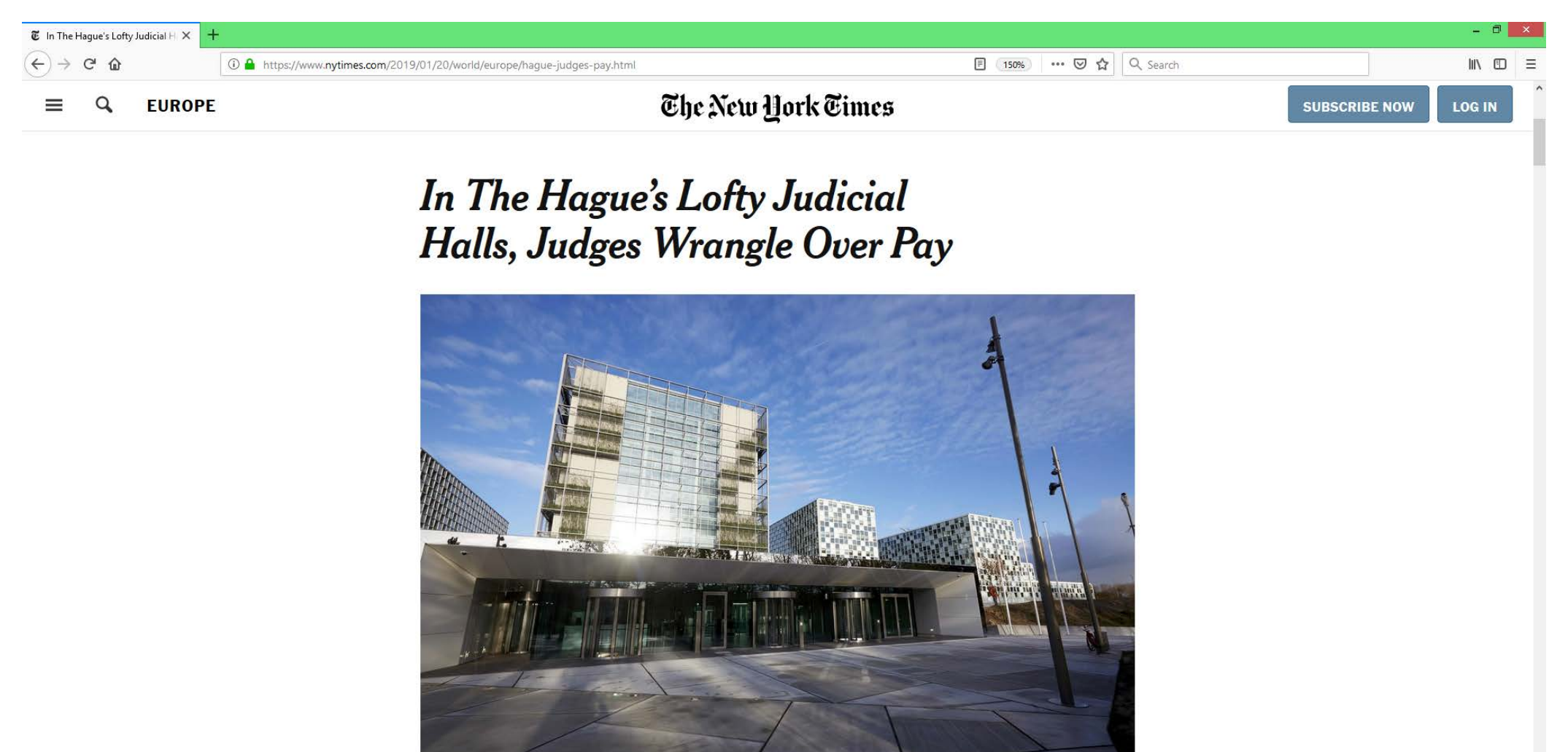
The International Criminal Count in The Harus